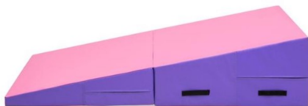
Sky4361-pink and purple