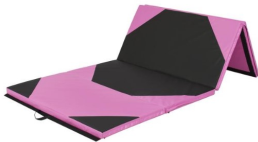
Sky2825-black and pink