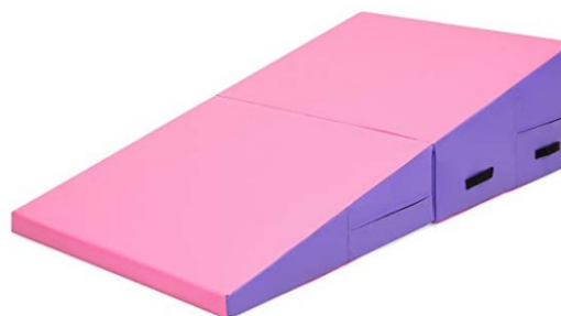
Sky4362-pink and purple