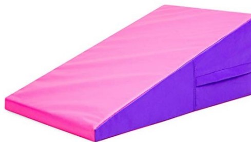
Sky4360-pink and purple