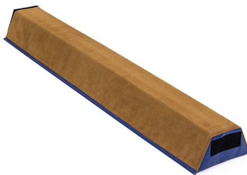
Sky3976-tan and dark blue color