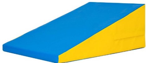
Sky1477-blue and yellow