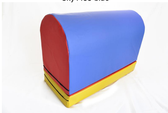
Sky5149-yellow red dark blue