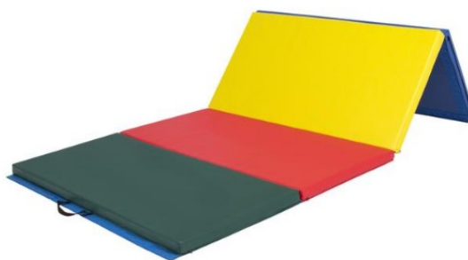
Sky2841-green red yellow dark blue